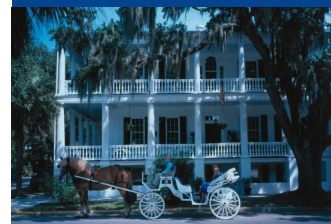
You'll feel like you've traveled back in time!