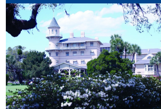
Jekyll Island - Georgia's elite coastal barrier island