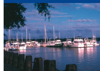
Beaufort, SC - "Queen of the Carolina Sea Islands"