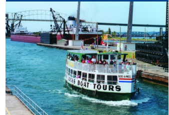
Soo Locks Cruise in Sault Sainte Marie