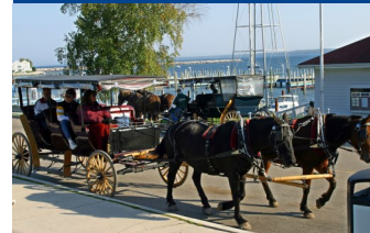
Tour Mackinac Island by Horse and Carriage

*$1,499.00 per Person Double Occupancy Add $589.00 for Single Occupancy $100.00 Due with Registration Final Payment Due April 14, 2025