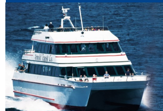
Mackinac Island Ferry

FAITH BASED TOUR HOSTING SERVING THE NORTH FLORIDA AREA