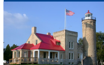
Mackinac Point Lighthouse