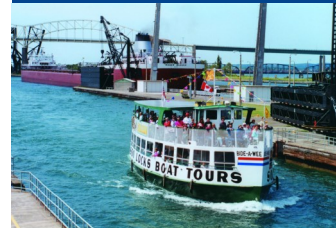
Soo Locks Cruise in Sault Sainte Marie