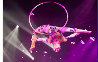
"ARRAY"- Pigeon Forge's Newest Variety Show