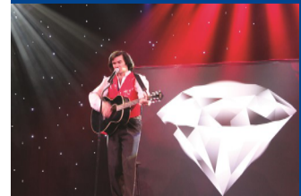
A NEIL DIAMOND Tribute Show