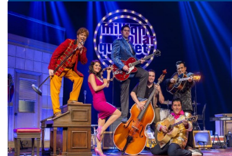
THE "MILLION DOLLAR QUARTET" DINNER SHOW