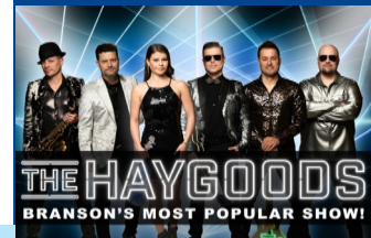
THE HAYGOODS SHOW