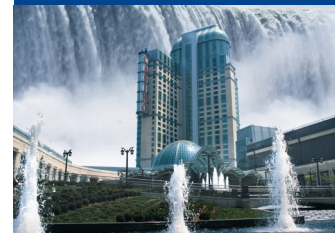
Free time at Niagara Falls Area