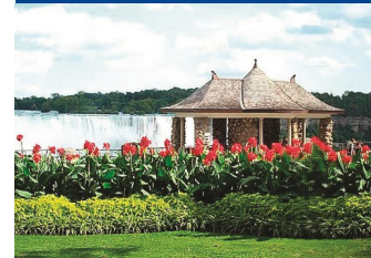
Visit beautiful Queen Victoria Park

ADD PEACE OF MIND TO YOUR TRIP... With the Travel Confident™ Protection Plan if you have to unexpectedly cancel or cut your plans short.