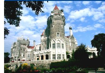
Magnificent Casa Loma Castle in Toronto