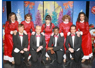
"TIS THE SEASON" SHOW