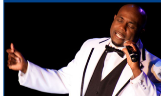
Soul of Motown