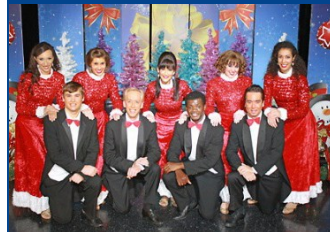
"TIS THE SEASON" SHOW