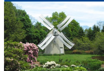
One of Cape Cod's many Windmills

Faith Based Tour Hosting serving the North Florida Area