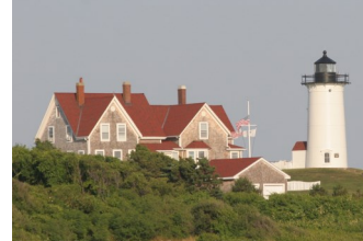
Lighthouse overlooking Vineyard Sound