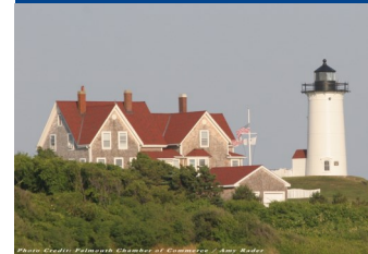
Lighthouse overlooking Vineyard Sound