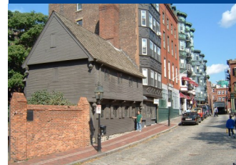
Experience 17th century history in Plymouth, MA