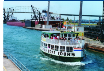
Soo Locks Cruise in Sault Sainte Marie