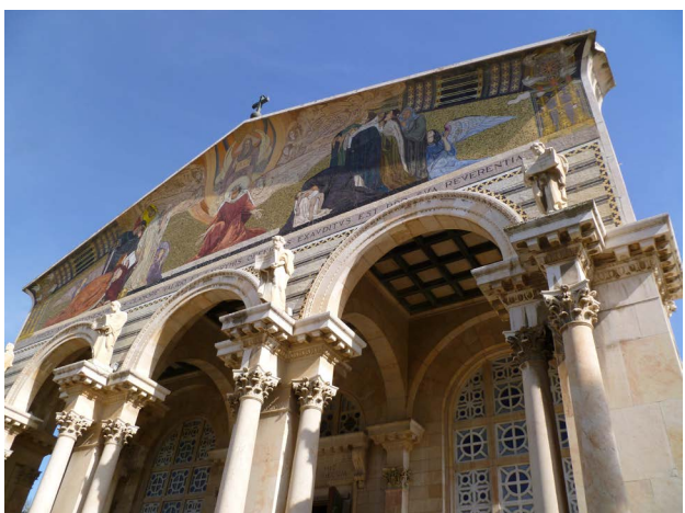
Some departures may begin in Jerusalem and end in the Galilee.