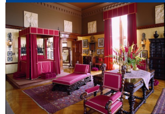
Grand Victorian architecture.