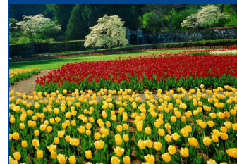
One of the Biltmore's many gardens.

FAITH BASED TOUR HOSTING SERVING THE NORTH FLORIDA AREA