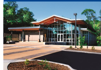
The Blue Ridge Parkway Visitor Center.