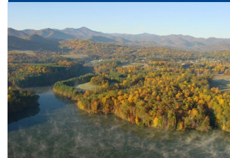
View the Blue Ridge Mountains.