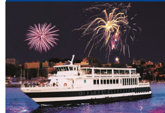
Dinner Cruise on beautiful Lake Champlain