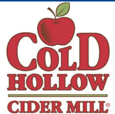
Cold Hollow Cider Mill