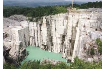
Rock of Ages Granite Quarry