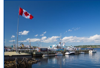
Enjoy a visit to historic Halifax

*$1,899.00 Per Person Double Occupancy Add $779.00 Single Occupancy $100.00 Due with Registration Final Payment Due May 27, 2021