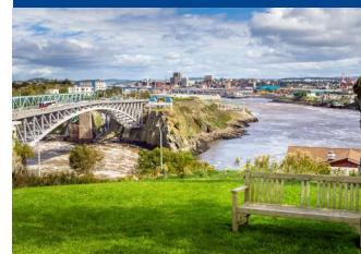
Visit Saint John - located on the shore of the Bay of Fundy

FAITH BASED TOUR HOSTING SERVING THE NORTH FLORIDA AREA