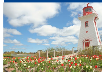
Visit to picturesque Prince Edward Island