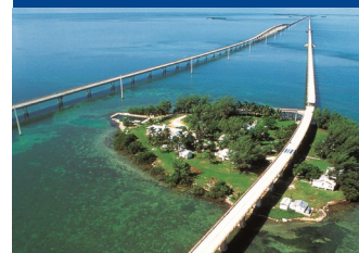
The famous 7-Mile Bridge to Key West