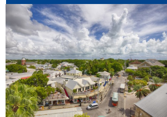
Magnificent Key West