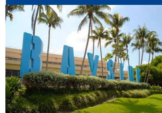
Fabulous Shopping at Bayside Marketplace