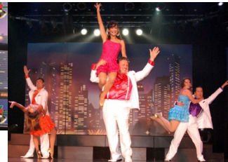
AMERICA'S HIT PARADE SHOW