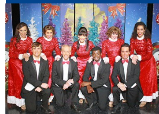
"TIS THE SEASON" SHOW