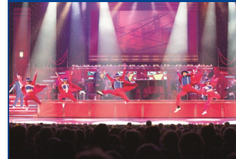
Enjoy the "BRITAIN'S BEST" Show at the American Music Theatre