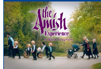
Experience the Amish lifestyle