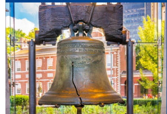
Take a visit to Philadelphia