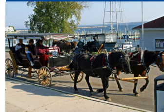
Tour Mackinac Island by Horse and Carriage