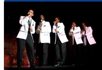
SOUL OF MOTOWN