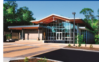
The Blue Ridge Parkway Visitor Center.