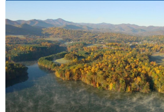
View the Blue Ridge Mountains.

*$469.00 Per Person Double Occupancy Add $90.00 for Single Occupancy $100.00 Due with Registration Final Payment Due February 21, 2019