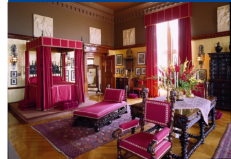
Grand Victorian architecture.