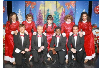
"TIS THE SEASON" SHOW