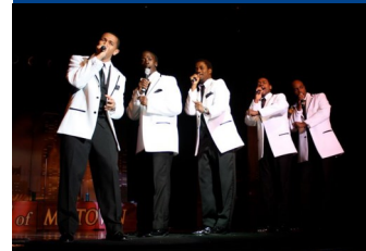
SOUL OF MOTOWN