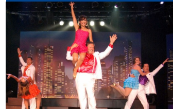
AMERICA'S HIT PARADE SHOW