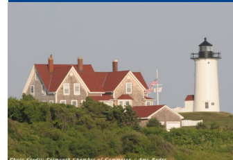
Lighthouse overlooking Vineyard Sound